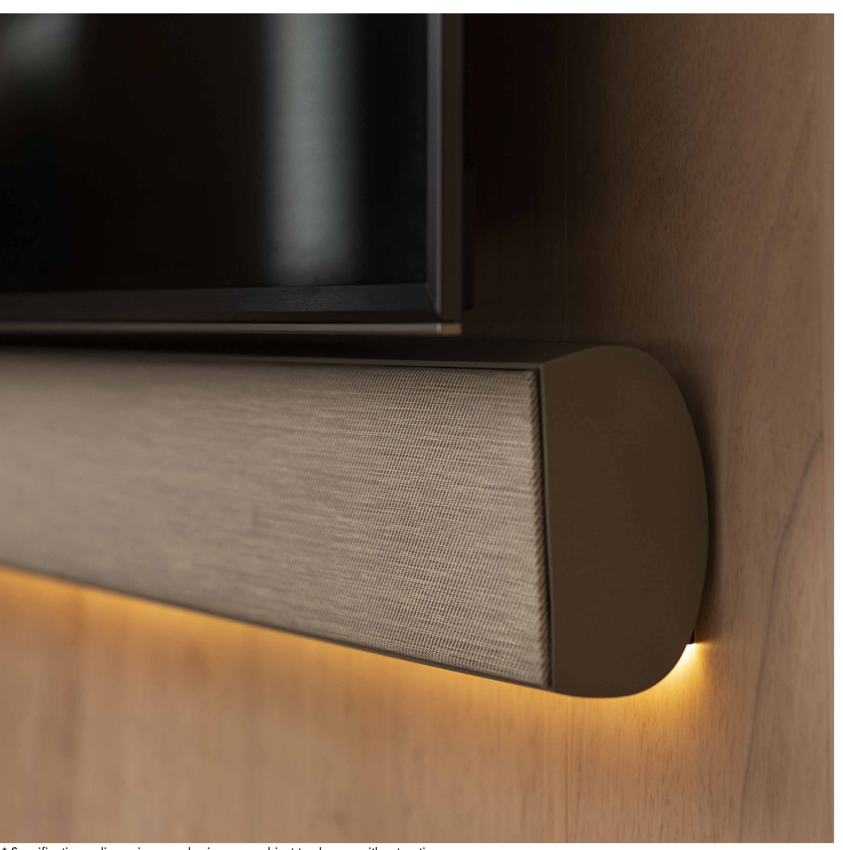
Specifications, dimensions, and prices are subject to change without notice

Built with the best quality extruded aluminum, with anodized brushed finishes, Outline Soundbars Series provides the best possible sound in its category.